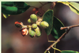
鳥心石 Formosan michelia Michelia compressa