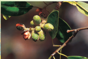
烏心石 Formosan michelia Michelia compressa

In line with governmental policy, the Pingtung Forest District Office has been afforesting Liuyi Mountain. Most of the species are endemic to Taiwan, such as Formosa sweet gum, Taiwan zelkova, Graffito's ash, Formosan michelia, Camphor tree, Taiwan incense cedar and Taiwan acacia. Honduras mahogany, however, is a foreign species.