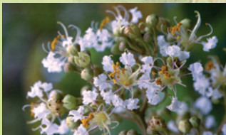
九芎花 Flowers of Subcostate crape myrtle

Subcostate crape myrtle has smooth, shiny trunk; even monkeys find it difficult to climb, hence its nickname "monkey slip tree." Its timber was widely used as firewood and agricultural equipment. It is an ideal species to plant along rivers and on slopes to help soil retain water. Subcostate crape myrtle blooms from June to August with small white flowers. Leaves turn beautifully pink in fall before dropping.