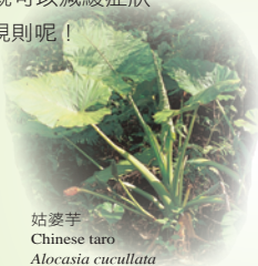
姑婆芋 Chinese taro Alocasia cucullata

Stinging nettle, a small herb, and Poisonous wood nettle, a small tree, are both shunned by hikers. Their leaves are covered with stinging hairs, which produce toxic formic acid, and when it comes in contact with skin, a burning sensation occurs. Not to worry. The juice of Chinese taro helps neutralize the toxin and alleviate the symptom.