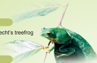
莫氏樹蛙 Moltrecht's treefrog Rhacophorus moltrechti