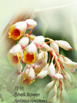
月桃 Shell flower Aplina speciosa