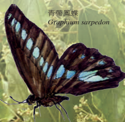
青帶鳳蝶 Graphium sarpedon