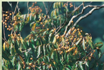
無患子果實 Fruits of Chinese soap berry