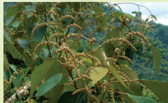
白袍子 Turn-in-the Wind allotus paniculatus

Vegetation of Liuyi Mountain includes secondary forest, plantation and economic crops. Secondary forest is a forest that has re-grown after major disturbances. Common species include Large-leaved Machilus, Chinese Soap Berry, Subcostate crape myrtle, Japanese mallotus, Macaranga, Turn-in-the Wind and India-charcoal Trema. Liuyi Mountain has large plantation with rich tree species in Taiwan. Taiwan incense cedar, Formosan Michelia and Formosa sweet gum are densely distributed along the trail. Economic crops are Flowering michelia, Longan, Betel nut plam, Ma bamboo and Moso bamboo.