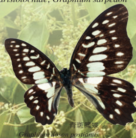
青斑鳳蝶 Graphium doston postitimus