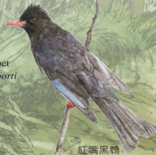
紅嘴黑鶇 Black bulbul Hypsipetes madagascariensis