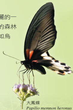
大鳳蝶 Papilio memnon heronus

Butterflies of the family Papilioninae are the largest and showiest, easily attracting people's attention. In Liuyi Mountain, there are many plants preferred by these butterflies' larvae, such as Formosan michelia, Camphor tree, Common jasmine orange and Calico flower. Commonly seen members of the family Papilioninae are Papilio memnon heronus , Pachliopta aristolochiae , Graphium sarpedon connectens and Graphium agamemnon .