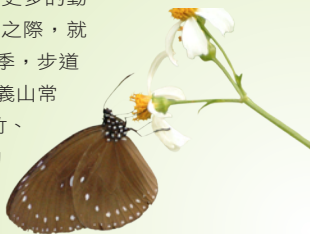
小紫斑蝶 Euploea tulliolus koxinga

植物多樣性越高的森林，越能提供更多的動物棲息，蝴蝶也不例外。每年春暖花開之際，就是六義山賞蝶季的開始，一直延續到冬季，步道沿途都可見到不同的蝴蝶一路伴隨。六義山常見的山黃麻、朴樹、盤龍木、麻竹、桂竹、青楓等植物，是蛺蝶科蝴蝶幼蟲喜愛的食草，常見的蛺蝶科蝴蝶有淡小紋青斑蝶、小紫斑蝶、台灣三線蝶、豹紋蝶、雌褐蔭蝶、永澤黃斑蔭蝶等。