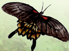
大鳳蝶 Papilio memnon heronus