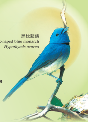
黑枕藍鶇 Black-naped blue monarch Hypothymis azurea

黑枕藍鶇 Hypothymis azurea Black-naped blue monarch