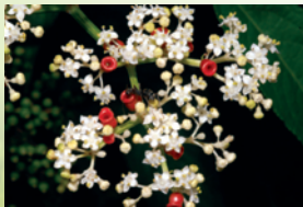
右骨消 Formosan elderberry Sambucus formosana