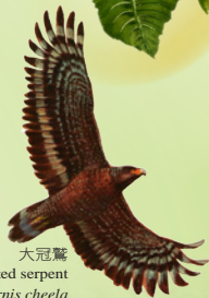
大冠鷲 Crested serpent Spilornis cheela

台灣典型次生林常見的鳥類本地都有，代表性的是上空飛翔的大冠鷲、小雨燕；在樹冠層活動的有五色鳥、紅嘴黑鶇、樹鵲，在中層活動的多為繡眼畫眉、黑枕藍鶇，活躍於森林底層的多為小彎嘴畫眉、山紅頭等，於森林邊緣常見大卷尾、白頭翁、綠繡眼等之出沒。