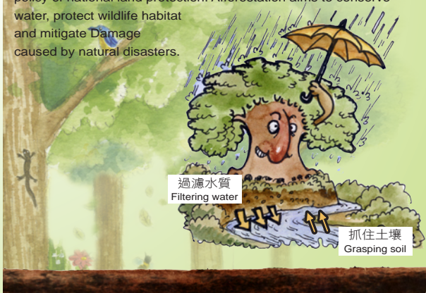
過濾水質 Filtering water

Timber export was an important economic activity for Taiwan during the first half of the 19th century. The government banned logging of natural forests in 1992 and started implementing the policy of national land protection. Afforestation aims to conserve water, protect wildlife habitat and mitigate Damage caused by natural disasters.